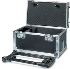
Transport case for THERMOMARK printer, rounded profile case with aluminum frame

Please be informed that the data shown in this PDF Document is generated from our Online Catalog. Please find the complete data in the user's documentation. Our General Terms of Use for Downloads are valid ( http://phoenixcontact.com/download )