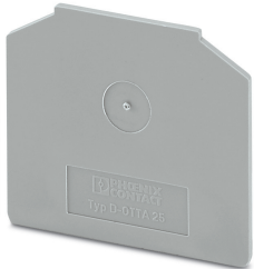
End cover, length: 60 mm, width: 2 mm, height: 52.6 mm, color: gray

Please be informed that the data shown in this PDF Document is generated from our Online Catalog. Please find the complete data in the user's documentation. Our General Terms of Use for Downloads are valid ( http://phoenixcontact.com/download )