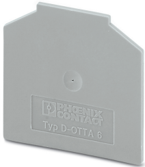
End cover, length: 43.5 mm, width: 1.5 mm, height: 40.8 mm, color: gray

Please be informed that the data shown in this PDF Document is generated from our Online Catalog. Please find the complete data in the user's documentation. Our General Terms of Use for Downloads are valid ( http://phoenixcontact.com/download )