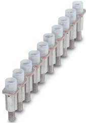
Fixed bridge, number of positions: 5, color: blue

Please be informed that the data shown in this PDF Document is generated from our Online Catalog. Please find the complete data in the user's documentation. Our General Terms of Use for Downloads are valid ( http://phoenixcontact.com/download )