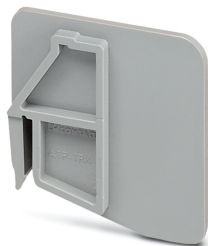
Partition plate, width: 2.2 mm

Please be informed that the data shown in this PDF Document is generated from our Online Catalog. Please find the complete data in the user's documentation. Our General Terms of Use for Downloads are valid ( http://phoenixcontact.com/download )