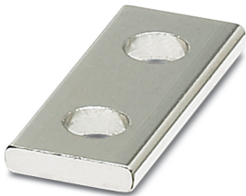
Connection element, number of positions: 2, color: silver

Please be informed that the data shown in this PDF Document is generated from our Online Catalog. Please find the complete data in the user's documentation. Our General Terms of Use for Downloads are valid ( http://phoenixcontact.com/download )