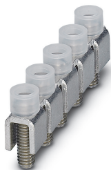
Fixed bridge, pitch: 15 mm, number of positions: 5, color: silver

Please be informed that the data shown in this PDF Document is generated from our Online Catalog. Please find the complete data in the user's documentation. Our General Terms of Use for Downloads are valid ( http://phoenixcontact.com/download )