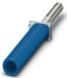
Female test connector, color: blue

Female test connector - PSBJ-URTK/S BU - 0311757