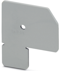
Separating plate, number of positions: 0, pitch: 0 mm, color: gray, width: 2 mm

Please be informed that the data shown in this PDF Document is generated from our Online Catalog. Please find the complete data in the user's documentation. Our General Terms of Use for Downloads are valid ( http://phoenixcontact.com/download )