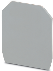
End cover, length: 52 mm, width: 2 mm, height: 60.6 mm, color: gray

Please be informed that the data shown in this PDF Document is generated from our Online Catalog. Please find the complete data in the user's documentation. Our General Terms of Use for Downloads are valid ( http://phoenixcontact.com/download )