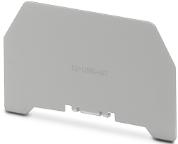
Separating plate, length: 70 mm, width: 4.8 mm, height: 43.5 mm, color: gray

Please be informed that the data shown in this PDF Document is generated from our Online Catalog. Please find the complete data in the user's documentation. Our General Terms of Use for Downloads are valid ( http://phoenixcontact.com/download )