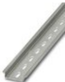
DIN rail perforated, Standard profile, width: 35 mm, height: 7.5 mm, acc. to EN 60715, material: Steel, galvanized, passivated with a thick layer, length: 2000 mm, color: silver

DIN rail perforated - NS 35/ 7,5 PERF 2000MM - 0801733