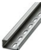
DIN rail perforated, G profile, width: 32 mm, height: 15 mm, acc. to EN 60715, material: Steel, galvanized, passivated with a thick layer, length: 2000 mm, color: silver

DIN rail perforated - NS 32 PERF 2000MM - 1201002