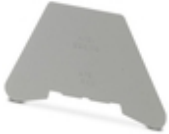
Partition plate, color: gray

Partition plate - ATS-SSK 116/RKN - 0203221