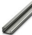
DIN rail, unperforated, G profile, width: 32 mm, height: 15 mm, acc. to EN 60715, material: Steel, galvanized, passivated with a thick layer, length: 2000 mm, color: silver

DIN rail, unperforated - NS 32 UNPERF 2000MM - 1201015