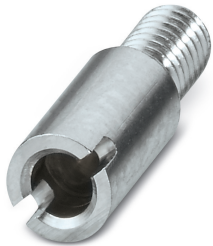
Female test connector, color: silver

Please be informed that the data shown in this PDF Document is generated from our Online Catalog. Please find the complete data in the user's documentation. Our General Terms of Use for Downloads are valid ( http://phoenixcontact.com/download )