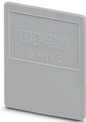
End cover, length: 28 mm, width: 1.5 mm, height: 33.4 mm, color: gray

Please be informed that the data shown in this PDF Document is generated from our Online Catalog. Please find the complete data in the user's documentation. Our General Terms of Use for Downloads are valid ( http://phoenixcontact.com/download )