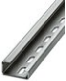
DIN rail perforated, G profile, width: 32 mm, height: 15 mm, acc. to EN 60715, material: Steel, galvanized, passivated with a thick layer, length: 2000 mm, color: silver

DIN rail perforated - NS 32 PERF 2000MM - 1201002