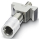
Female test connector, color: violet

Female test connector - PSBJ-GSK/S VT - 0305365