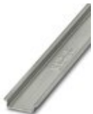
DIN rail, unperforated, Standard profile, width: 35 mm, height: 7.5 mm, acc. to EN 60715, material: Steel, galvanized, passivated with a thick layer, length: 2000 mm, color: silver

DIN rail, unperforated - NS 35/ 7,5 UNPERF 2000MM - 0801681