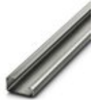
DIN rail, unperforated, G profile, width: 32 mm, height: 15 mm, acc. to EN 60715, material: Steel, galvanized, passivated with a thick layer, length: 2000 mm, color: silver

DIN rail, unperforated - NS 32 UNPERF 2000MM - 1201015