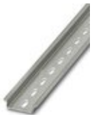
DIN rail perforated, Standard profile, width: 35 mm, height: 7.5 mm, acc. to EN 60715, material: Steel, galvanized, passivated with a thick layer, length: 2000 mm, color: silver

DIN rail perforated - NS 35/ 7,5 PERF 2000MM - 0801733