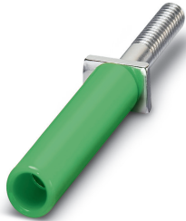
Female test connector, color: green

Please be informed that the data shown in this PDF Document is generated from our Online Catalog. Please find the complete data in the user's documentation. Our General Terms of Use for Downloads are valid ( http://phoenixcontact.com/download )