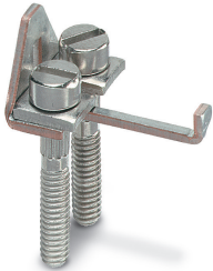
Switching jumper, pitch: 8.2 mm, number of positions: 2, color: silver

Please be informed that the data shown in this PDF Document is generated from our Online Catalog. Please find the complete data in the user's documentation. Our General Terms of Use for Downloads are valid ( http://phoenixcontact.com/download )