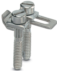
Switching jumper, pitch: 8.2 mm, number of positions: 2, color: silver

Please be informed that the data shown in this PDF Document is generated from our Online Catalog. Please find the complete data in the user's documentation. Our General Terms of Use for Downloads are valid ( http://phoenixcontact.com/download )