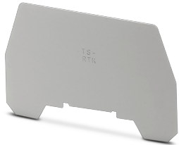
Partition plate, length: 72 mm, width: 0.8 mm, color: gray

Please be informed that the data shown in this PDF Document is generated from our Online Catalog. Please find the complete data in the user's documentation. Our General Terms of Use for Downloads are valid ( http://phoenixcontact.com/download )