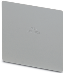
Special separating plate

Please be informed that the data shown in this PDF Document is generated from our Online Catalog. Please find the complete data in the user's documentation. Our General Terms of Use for Downloads are valid ( http://phoenixcontact.com/download )