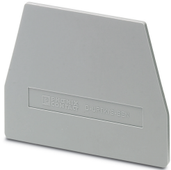
End cover, length: 61 mm, width: 2.2 mm, height: 48.5 mm, color: gray

Please be informed that the data shown in this PDF Document is generated from our Online Catalog. Please find the complete data in the user's documentation. Our General Terms of Use for Downloads are valid ( http://phoenixcontact.com/download )