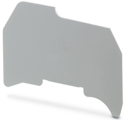
Separating plate, width: 0.8 mm, color: gray

Please be informed that the data shown in this PDF Document is generated from our Online Catalog. Please find the complete data in the user's documentation. Our General Terms of Use for Downloads are valid ( http://phoenixcontact.com/download )