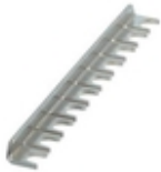
Fixed bridge, pitch: 8.2 mm, number of positions: 10, color: silver

Please be informed that the data shown in this PDF Document is generated from our Online Catalog. Please find the complete data in the user's documentation. Our General Terms of Use for Downloads are valid ( http://phoenixcontact.com/download )