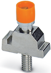
Slide, color: silver

Please be informed that the data shown in this PDF Document is generated from our Online Catalog. Please find the complete data in the user's documentation. Our General Terms of Use for Downloads are valid ( http://phoenixcontact.com/download )