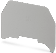
Separating plate, length: 61 mm, width: 0.8 mm, height: 45.5 mm, color: gray

Please be informed that the data shown in this PDF Document is generated from our Online Catalog. Please find the complete data in the user's documentation. Our General Terms of Use for Downloads are valid ( http://phoenixcontact.com/download )