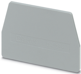
End cover, length: 61 mm, width: 2.2 mm, height: 41.5 mm, color: gray

Please be informed that the data shown in this PDF Document is generated from our Online Catalog. Please find the complete data in the user's documentation. Our General Terms of Use for Downloads are valid ( http://phoenixcontact.com/download )