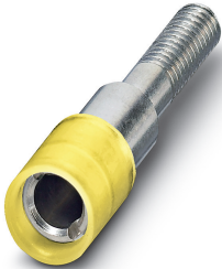
Female test connector, color: yellow

Please be informed that the data shown in this PDF Document is generated from our Online Catalog. Please find the complete data in the user's documentation. Our General Terms of Use for Downloads are valid ( http://phoenixcontact.com/download )