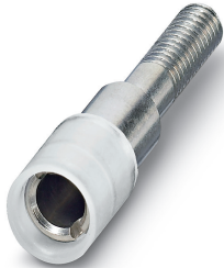
Female test connector, color: white

Please be informed that the data shown in this PDF Document is generated from our Online Catalog. Please find the complete data in the user's documentation. Our General Terms of Use for Downloads are valid ( http://phoenixcontact.com/download )