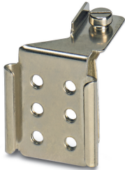
Screw holder, for storing a maximum of 6 switch screws of the ISSB 10-8

Please be informed that the data shown in this PDF Document is generated from our Online Catalog. Please find the complete data in the user's documentation. Our General Terms of Use for Downloads are valid ( http://phoenixcontact.com/download )