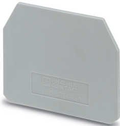
End cover, length: 61.2 mm, width: 1.5 mm, height: 48.5 mm, color: gray

Please be informed that the data shown in this PDF Document is generated from our Online Catalog. Please find the complete data in the user's documentation. Our General Terms of Use for Downloads are valid ( http://phoenixcontact.com/download )