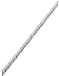
Jumper, number of positions: 100, color: silver

Please be informed that the data shown in this PDF Document is generated from our Online Catalog. Please find the complete data in the user's documentation. Our General Terms of Use for Downloads are valid ( http://phoenixcontact.com/download )