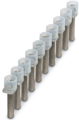
Jumper, pitch: 8 mm, number of positions: 10, color: silver

Please be informed that the data shown in this PDF Document is generated from our Online Catalog. Please find the complete data in the user's documentation. Our General Terms of Use for Downloads are valid ( http://phoenixcontact.com/download )