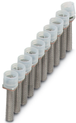
Jumper, pitch: 6 mm, number of positions: 10, color: silver

Please be informed that the data shown in this PDF Document is generated from our Online Catalog. Please find the complete data in the user's documentation. Our General Terms of Use for Downloads are valid ( http://phoenixcontact.com/download )