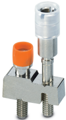
Switching jumper, number of positions: 2, color: silver

Please be informed that the data shown in this PDF Document is generated from our Online Catalog. Please find the complete data in the user's documentation. Our General Terms of Use for Downloads are valid ( http://phoenixcontact.com/download )