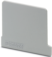
End cover, length: 4.2 mm, width: 1.3 mm, height: 35.3 mm, color: gray

Please be informed that the data shown in this PDF Document is generated from our Online Catalog. Please find the complete data in the user's documentation. Our General Terms of Use for Downloads are valid ( http://phoenixcontact.com/download )