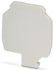
End cover, insulation material: ceramic

Please be informed that the data shown in this PDF Document is generated from our Online Catalog. Please find the complete data in the user's documentation. Our General Terms of Use for Downloads are valid ( http://phoenixcontact.com/download )