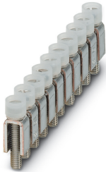
Fixed bridge, pitch: 6 mm, number of positions: 10, color: silver

Please be informed that the data shown in this PDF Document is generated from our Online Catalog. Please find the complete data in the user's documentation. Our General Terms of Use for Downloads are valid ( http://phoenixcontact.com/download )