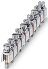
Fixed bridge, pitch: 10 mm, number of positions: 10, color: silver

Please be informed that the data shown in this PDF Document is generated from our Online Catalog. Please find the complete data in the user's documentation. Our General Terms of Use for Downloads are valid ( http://phoenixcontact.com/download )