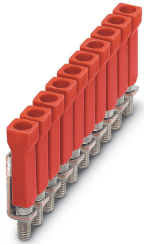
Jumper, pitch: 6 mm, number of positions: 10, color: red

Please be informed that the data shown in this PDF Document is generated from our Online Catalog. Please find the complete data in the user's documentation. Our General Terms of Use for Downloads are valid ( http://phoenixcontact.com/download )