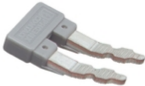
Insertion bridge, pitch: 8 mm, number of positions: 2, color: gray

Please be informed that the data shown in this PDF Document is generated from our Online Catalog. Please find the complete data in the user's documentation. Our General Terms of Use for Downloads are valid ( http://phoenixcontact.com/download )