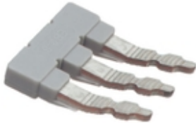
Insertion bridge, pitch: 8 mm, number of positions: 3, color: gray

Please be informed that the data shown in this PDF Document is generated from our Online Catalog. Please find the complete data in the user's documentation. Our General Terms of Use for Downloads are valid ( http://phoenixcontact.com/download )