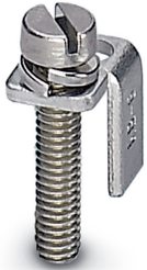
Chain bridge, number of positions: 1, color: silver

Please be informed that the data shown in this PDF Document is generated from our Online Catalog. Please find the complete data in the user's documentation. Our General Terms of Use for Downloads are valid ( http://phoenixcontact.com/download )