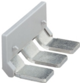
Insertion bridge, pitch: 36 mm, number of positions: 3, color: gray

Please be informed that the data shown in this PDF Document is generated from our Online Catalog. Please find the complete data in the user's documentation. Our General Terms of Use for Downloads are valid ( http://phoenixcontact.com/download )