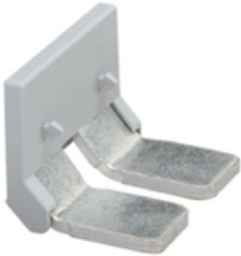
Insertion bridge, pitch: 36 mm, number of positions: 2, color: gray

Please be informed that the data shown in this PDF Document is generated from our Online Catalog. Please find the complete data in the user's documentation. Our General Terms of Use for Downloads are valid ( http://phoenixcontact.com/download )