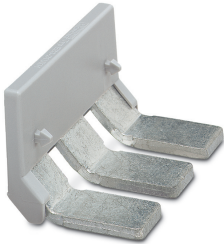
Insertion bridge, pitch: 31 mm, number of positions: 3, color: gray

Please be informed that the data shown in this PDF Document is generated from our Online Catalog. Please find the complete data in the user's documentation. Our General Terms of Use for Downloads are valid ( http://phoenixcontact.com/download )