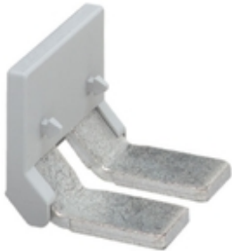
Insertion bridge, pitch: 31 mm, number of positions: 2, color: gray

Please be informed that the data shown in this PDF Document is generated from our Online Catalog. Please find the complete data in the user's documentation. Our General Terms of Use for Downloads are valid ( http://phoenixcontact.com/download )