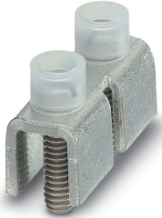
Fixed bridge, pitch: 20 mm, number of positions: 2, color: silver

Please be informed that the data shown in this PDF Document is generated from our Online Catalog. Please find the complete data in the user's documentation. Our General Terms of Use for Downloads are valid ( http://phoenixcontact.com/download )