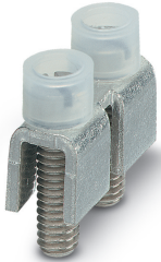
Fixed bridge, pitch: 15 mm, number of positions: 2, color: silver

Please be informed that the data shown in this PDF Document is generated from our Online Catalog. Please find the complete data in the user's documentation. Our General Terms of Use for Downloads are valid ( http://phoenixcontact.com/download )