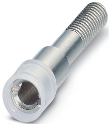
Female test connector, color: silver

Please be informed that the data shown in this PDF Document is generated from our Online Catalog. Please find the complete data in the user's documentation. Our General Terms of Use for Downloads are valid ( http://phoenixcontact.com/download )