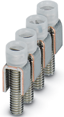
Fixed bridge, pitch: 8 mm, number of positions: 4, color: silver

Please be informed that the data shown in this PDF Document is generated from our Online Catalog. Please find the complete data in the user's documentation. Our General Terms of Use for Downloads are valid ( http://phoenixcontact.com/download )